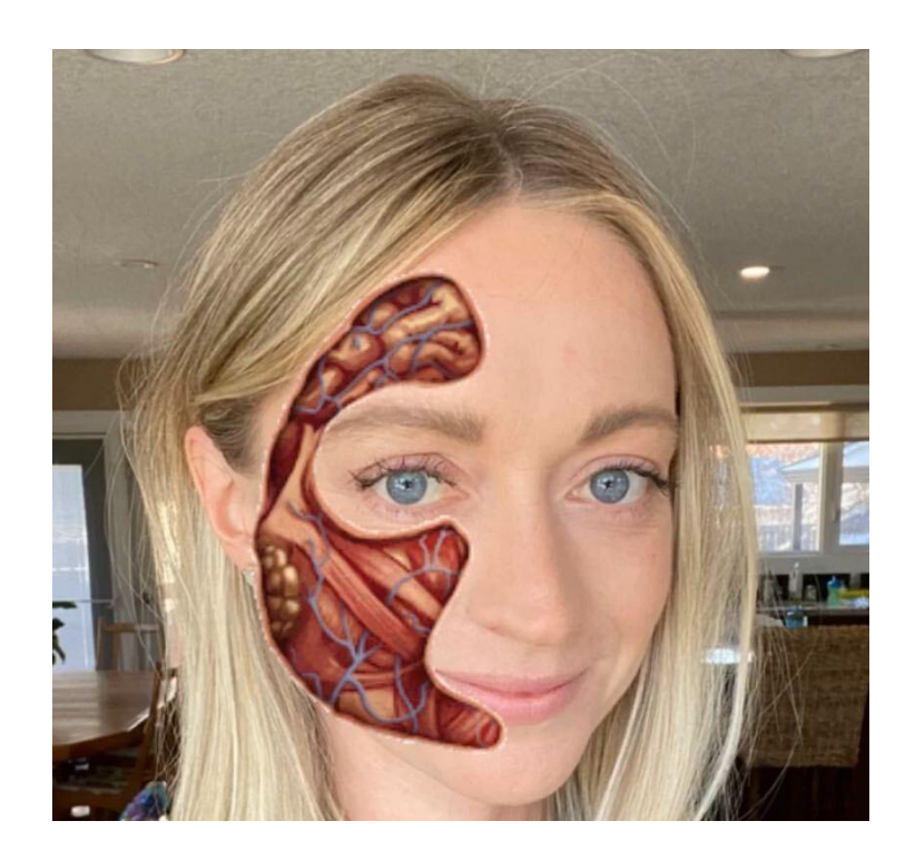
Step 6: Tag a friend, and nominate them to post their own story.

Step 5: Move it around, and resize if needed.