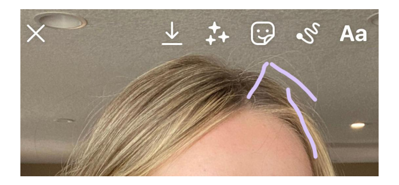
Step 4: Search "AWHF", and click the sticker you would like to use.

Step 3: Add the sticker of your choice to your selfie, by clicking the "Smile" on the top right.